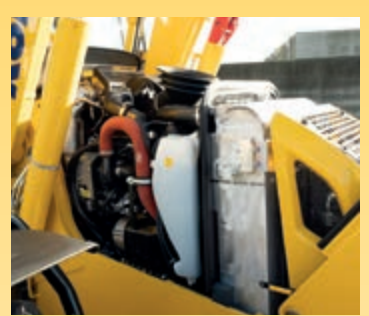
Daily maintenance is enhanced thanks to the double position front opening and the check point position easily accessible on the left side