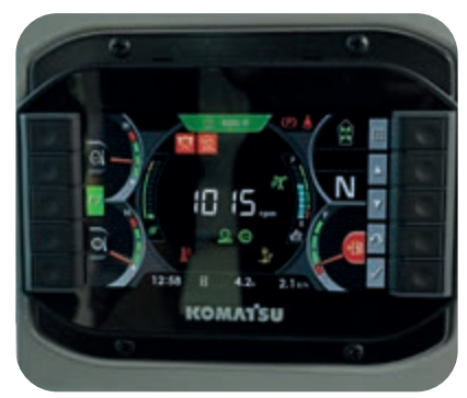
7" multi-function monitor