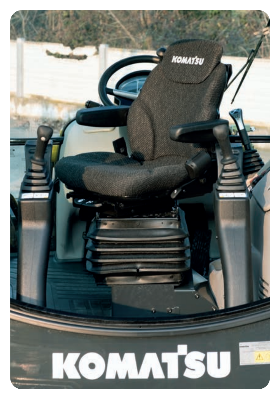
Convenient, ergonomic and precise control