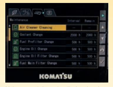
Maintenance information displayed on the monitor