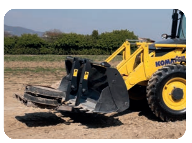
A wide range of buckets and attachments is available. Your Komatsu distributor is ready to assist you with the selection of suitable options.