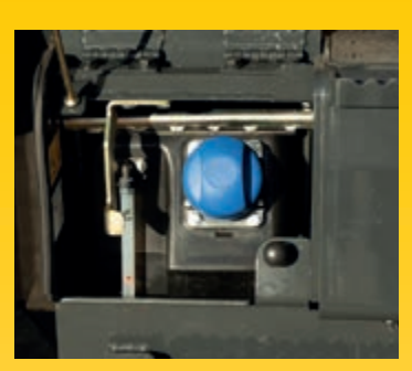
AdBlue®, fuel and hydraulic oil tank are easily accessible on the machine side and refilled by ground level, ensuring a fatigue less operation

When you purchase Komatsu equipment, you gain access to a broad range of programmes and services that have been designed to help you get the most from your investment. For example, Komatsu's Flexible Warranty Programme provides a range of extended warranty options on the machine and its components. These can be chosen to meet your individual needs and activities. This programme is designed to help reduce total operating costs.